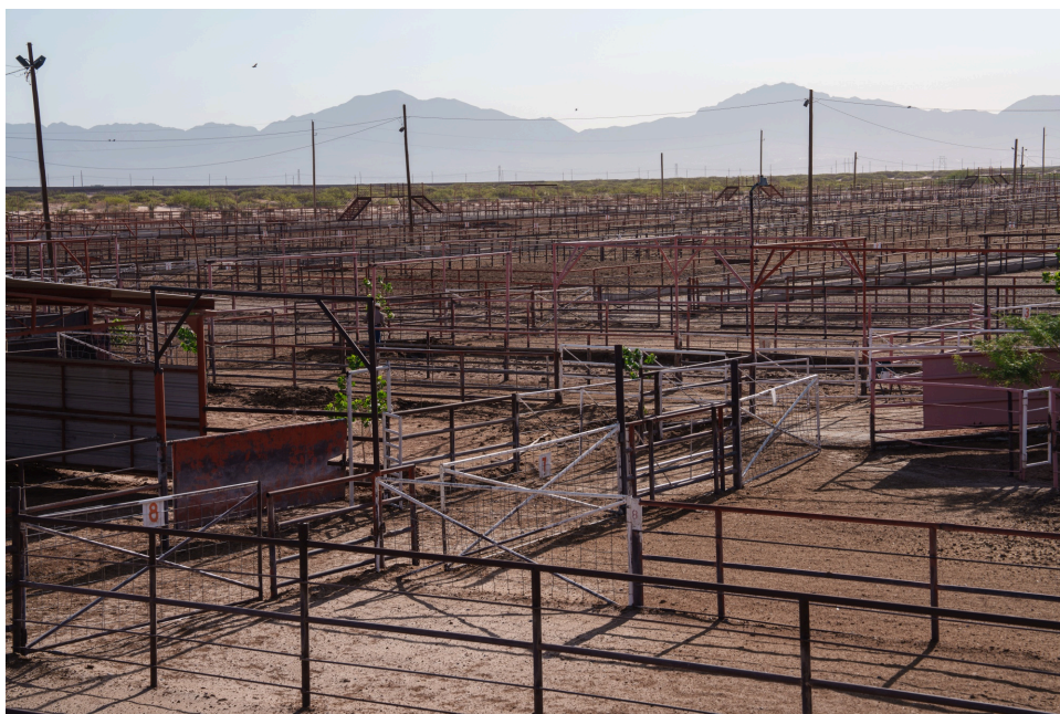
Empty corrals at the Union Ganadera Chihuahua cattle import facility in Santa Teresa, New Mexico in June.

The situation, exacerbated by an ongoing halt of Mexican cattle shipments to prevent the spread of the deadly screwworm pest, is a major stress for beef processors that are operating at losses. It's also setting the slate for more expensive American steaks for longer, complicating President Donald Trump's efforts to bring down record beef prices.