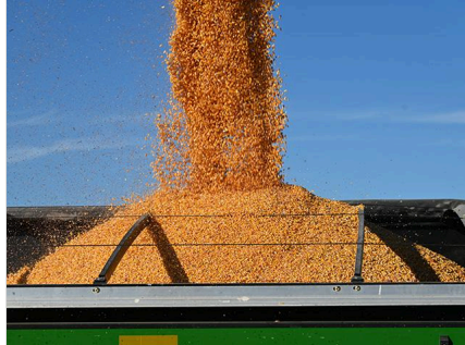
A Nebraska farmer has asked the U.S. Bankruptcy Court in Nebraska to void a corn-delivery contract he had with Hansen-Mueller Co., as part of the company's ongoing Chapter 11 bankruptcy.

LINCOLN, Neb. (DTN) -- Hansen-Mueller Co. told Nebraska regulators that 38 farmers in the state had been paid for grain deliveries as part of an agreement to reinstate the company's grain dealer license. But at least one Nebraska farmer said he remains unpaid and has asked a federal bankruptcy court to declare that a contract for future corn deliveries cannot be assumed or assigned by the company.