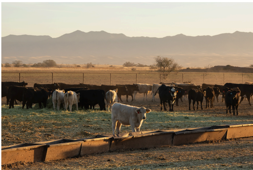
Beef cattle at a ranch in Sonoita, Arizona.