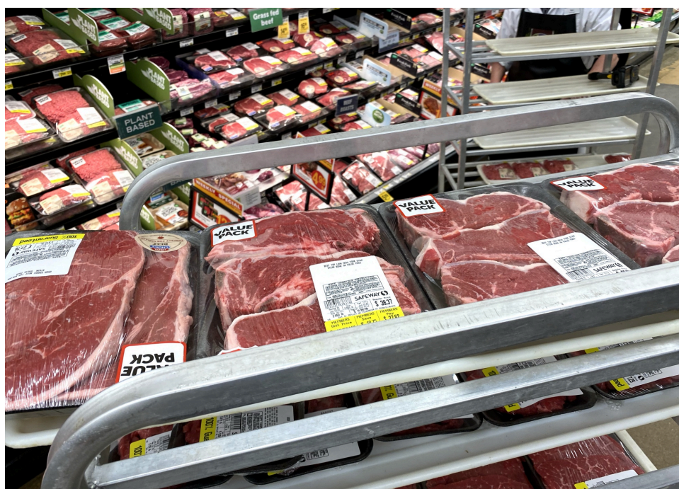
Trays of beef for sale at a supermarket in McLean, Virginia.

Tyson on Friday said it is ending operations at a beef plant in Nebraska and cutting a shift at a Texas facility as the meat producer loses millions.