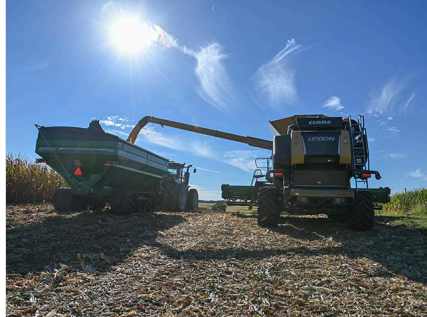
Unsecured creditors in Hansen-Mueller's Chapter 11 bankruptcy case have asked for more time leading up to the company's asset sale.

LINCOLN, Neb. (DTN) -- The official committee of unsecured creditors in the Hansen-Mueller Co. Chapter 11 bankruptcy asked a U.S. Bankruptcy Court in Nebraska to slow down the company's effort to sell its assets in an expedited fashion, asking the court for an additional 30 to 45 days.