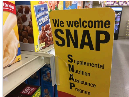
The government shutdown affects the incomes of federal employees but also risks cutting off food-aid benefits to roughly 42 million who are on the Supplemental Nutrition Assistance Program (SNAP).

Leaders of the world's most prosperous country now are preparing an unprecedented move to cut off food aid to their most vulnerable citizens.