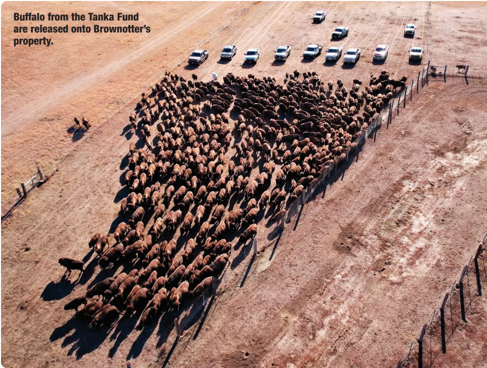
Buffalo from the Tanka Fund are released onto Brownotter's property.

hundred acres and are used to human interaction, Brownotter's herd is wild, and may take days to track.