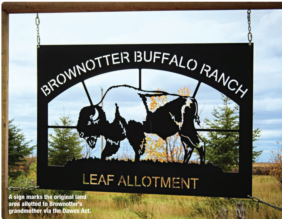
A sign marks the original land area allotted to Brownotter's grandmother via the Dawes Act.

Thinking the funds were on their way, he secured a range unit, which is a section of grazing land on a reservation that can be rented with a permit from the Tribal government, and started building fence for his future buffalo herd.