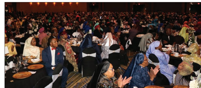
Attendees enjoy a banquet and concert.