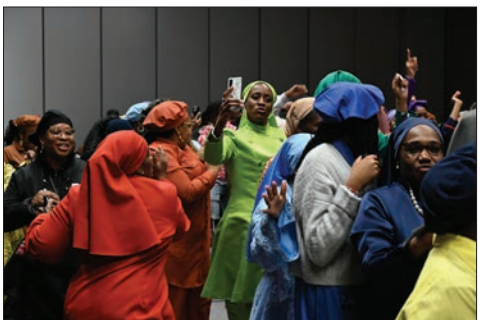
Saviours' Day 2024 was held in Detroit and included plenary sessions, informative workshops and righteous, fun entertainment for the entire family.