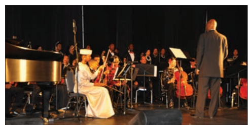
A musical concert took place the evening of Feb. 23.