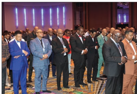
Men pray at congressional Friday prayer service.