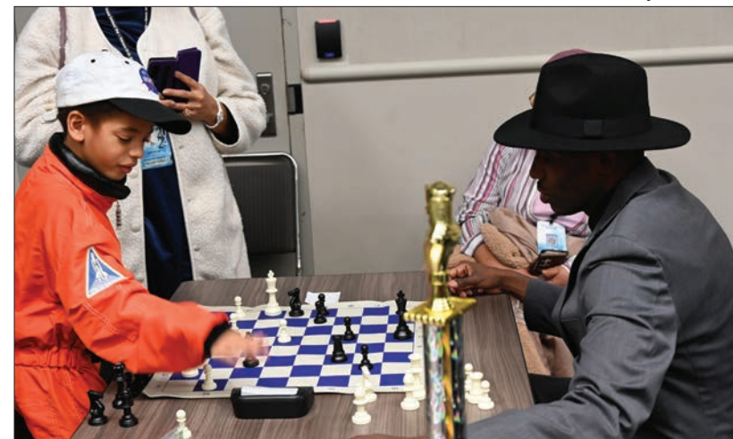
A speed chess tournament was held for the second year in a row.