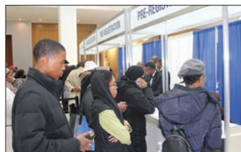
Attendees line up for registration.