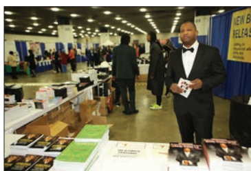
The Final Call vending area stayed busy the entire weekend.