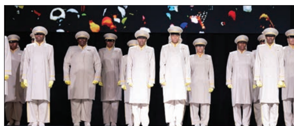
The drill competition is always a popular attraction during Saviours' Day.