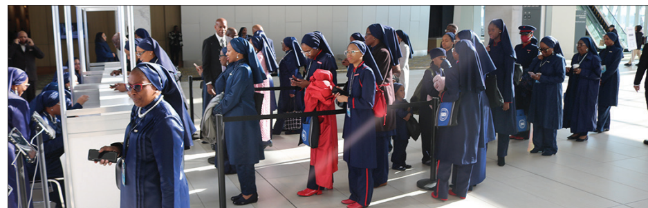
Saviours' Day is the annual convention of the Nation of Islam.