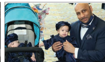
The weekend was enjoyable for families.