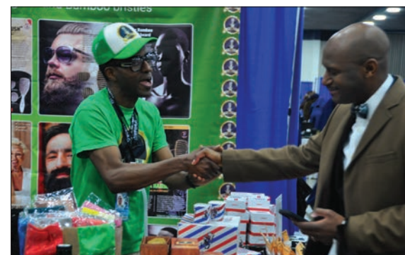
Throughout the weekend attendees enjoyed riveting, multifaceted events. They exhibited and enjoyed how the Nation of Islam, followers of the Most Honorable Elijah Muhammad under the divine guidance of the Honorable Minister Louis Farrakhan has been winning the fight of good over evil.