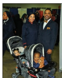
Family enjoys Saviours' Day.