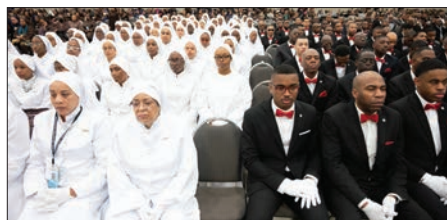
Newly registered men and women join the ranks of the Nation of Islam.