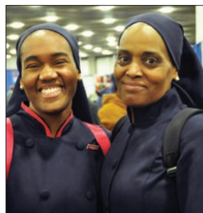
Sisters all smiles during Saviours' Day.