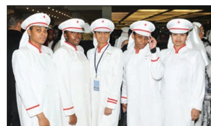
M.G.T. Vanguard pose for photo.