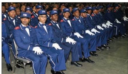
Newly registered F.O.I. at graduation.