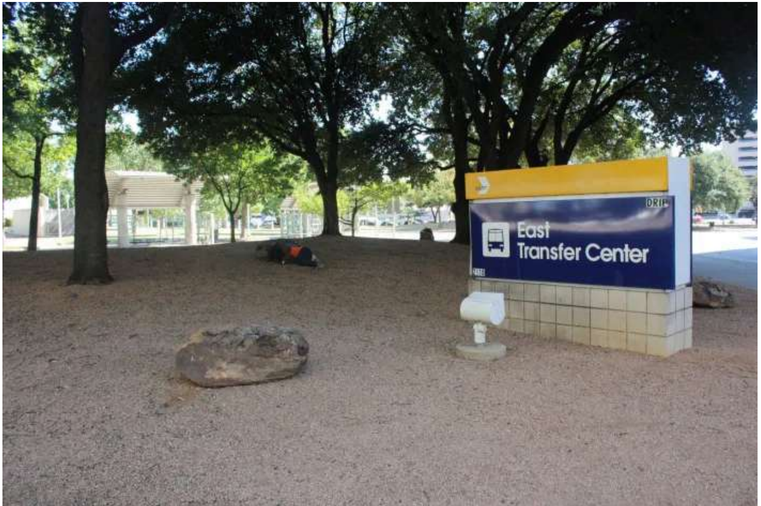
An unhoused resident takes refuge in the shade near East Transfer Center in the downtown area.