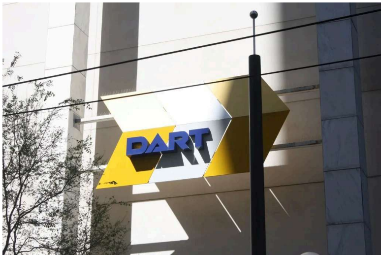
DART Headquarters at Akard Station in Downtown Dallas.

This does not include increases in arrests on other charges that can bear some connection to unhoused residents, such as disorderly conduct, drug possession/use, and public intoxication .