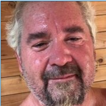
Our Hearts Just Break Over The Tragedy Of Guy Fieri