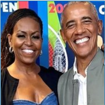
Michelle Obama Finally Addresses Barack Divorce Rumors