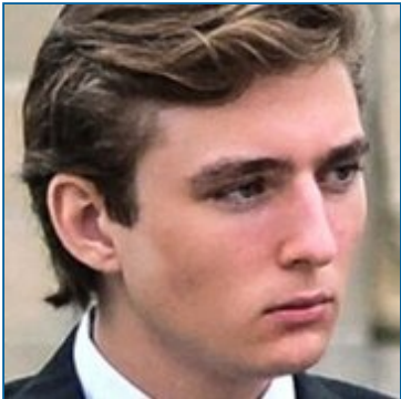
Barron Trump's Truth Is Out & Everybody Knows It