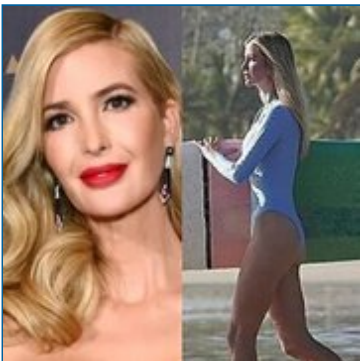
Ivanka Trump's Killer Figure Is A Sight To See