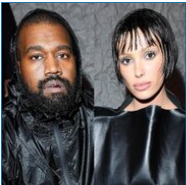
Kanye West Confirms Split From Bianca Censori 'She Ran Away'