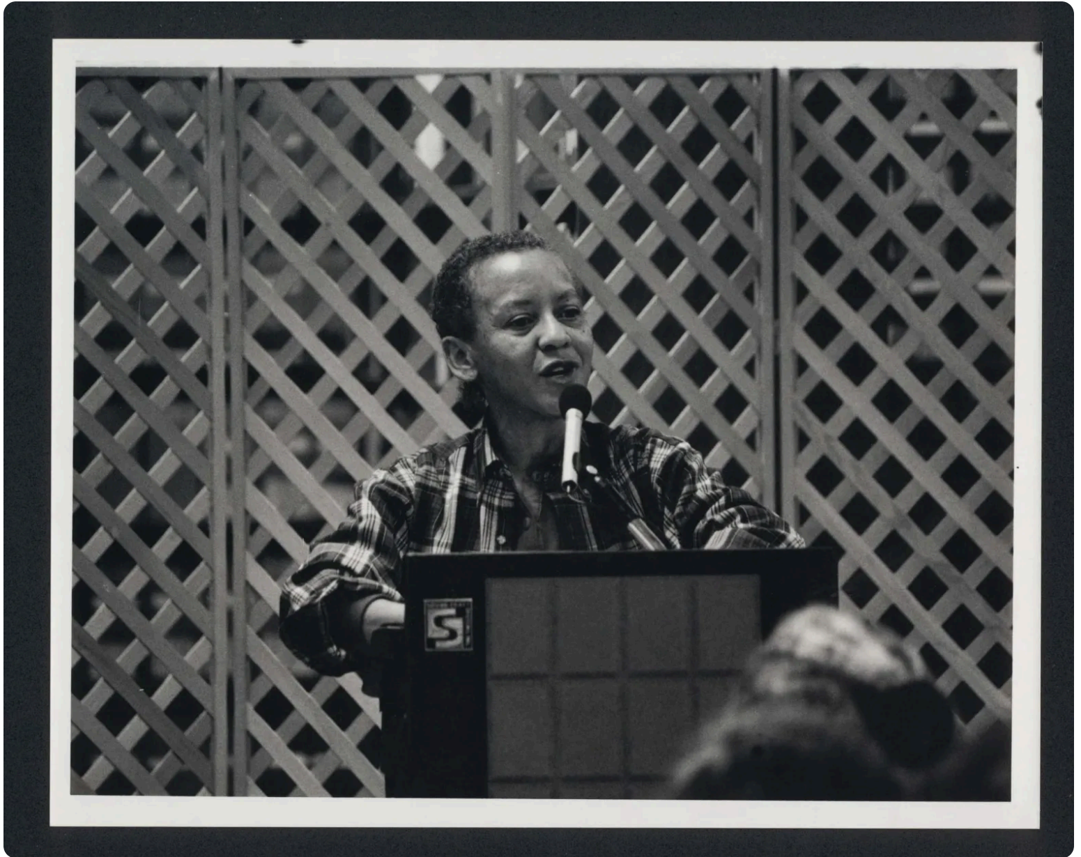
Nikki Giovanni, author of notable works such as “Black Judgement” and “Those Who Ride the Night Winds,” speaks on Dec. 4, 1993.

Mayberry said Black artists of today can continue Giovanni’s legacy of merging art and activism by realizing “their expression is a statement of revolution.”