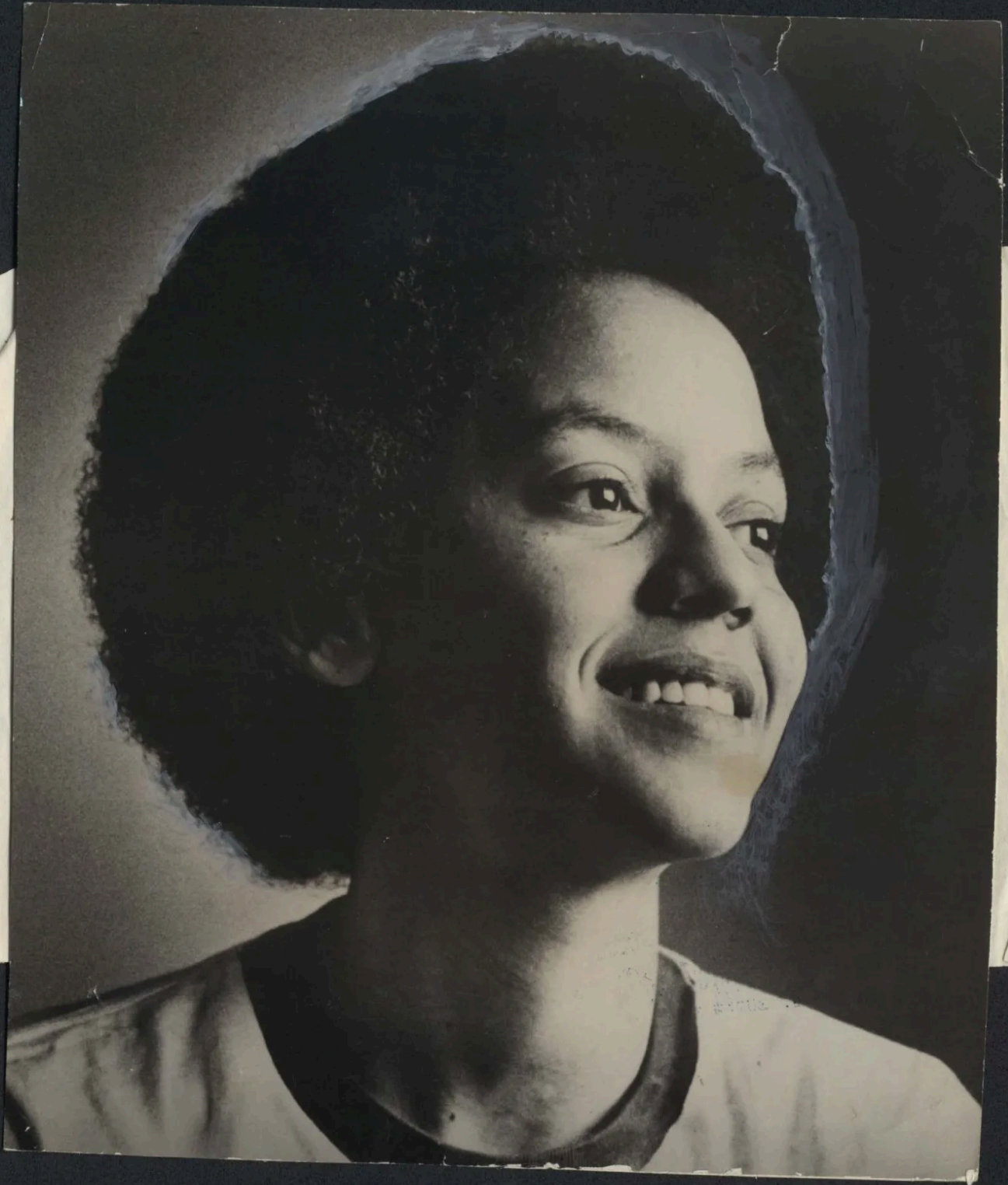
An AFRO Archives photo shows Nikki Giovanni on July 21, 1973, the same year she published "Ego Tripping and Other Poems for Young Readers."

"It's incredibly impactful and important when Black artists like Momma Giovanni choose to share their talent and genius with a clear intention of activism. What makes her work stand out even more is that she did this not just for people to hear, but specifically for Black people to hear, learn and grow from," said