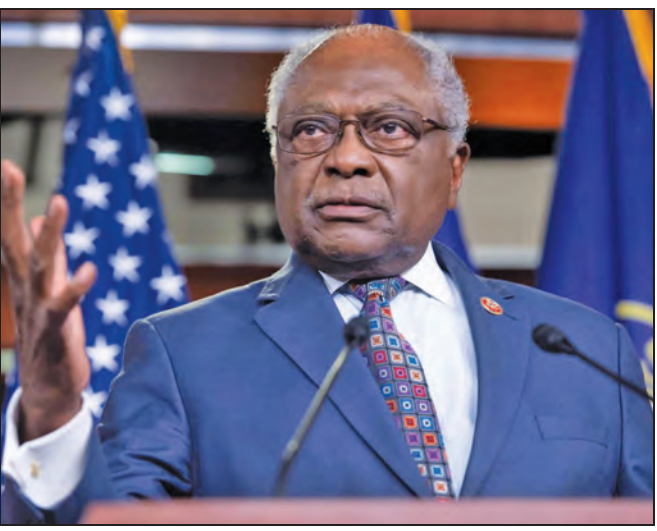
South Carolina Democratic Rep. James Clyburn of being made great. We just got to figure out ways to make this country's greatness accessible and affordable for all of our citizens. And Joe Biden is doing that. And we have got to stay focused on that," Clyburn stated emphatically. Clyburn, who had previously announced his intention to seek reelection, also

Longtime South Carolina Democratic Rep. James Clyburn has announced his resignation from his House leadership position, effective immediately, while simultaneously committing to run for reelection. Clyburn, a staunch supporter of President Joe Biden, said he aims to focus on conveying the message of inclusivity and unity that defines the greatness of the United States. During an interview on Sunday, Feb. 18, Clyburn, 83, expressed his continued disdain for former President Donald Trump's "Make America Great Again" mantra, asserting that the country is already great but needs to ensure accessibility and affordability for all citizens. He encouraged Biden to emphasize his experience, wisdom, and commitment to maintaining connections with the American people during the upcoming presidential campaign. "I am fond of saying, this is a great country in no need