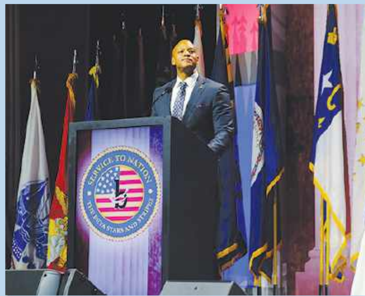
Maryland Gov. Wes Moore speaks to those gathered.