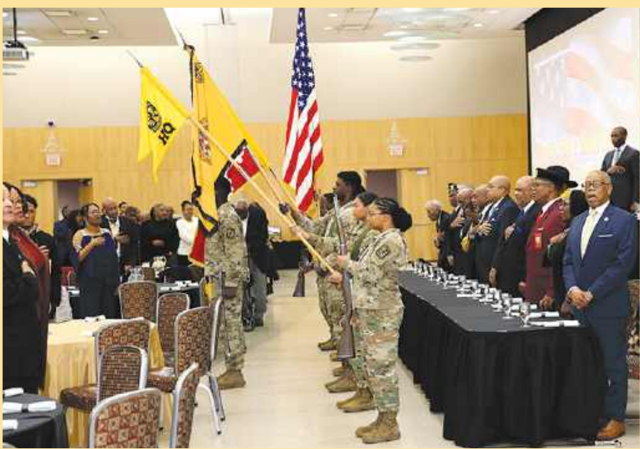
The Morgan State University Honor Guard presents colors.