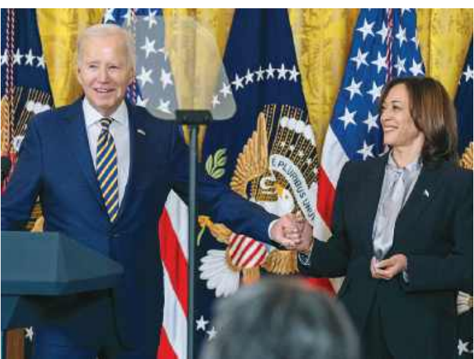
The Biden-Harris Administration announces student loan forgiveness for one group of Americans.

email those who will receive the debt cancellation today, another step in the administration’s ongoing efforts to address the nation’s staggering $1.77 trillion student debt crisis. The announcement comes after the Supreme Court invalidated the administration’s previous plan for widespread student loan forgiveness, which aimed to assist over 40 million borrowers in wiping away up to $20,000 in debt. U.S. Secretary of Education Miguel Cardona emphasized the administration’s commitment