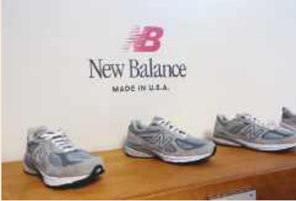
New Balance displays their 990 sneakers in gray.

New Balance, the popular shoe brand, connected with the D.C. creative community to celebrate the iconic 990 sneaker and its impact on the D.C. fashion scene. Local creators and business owners came together on Feb. 17 to discuss the District’s influence on both the brand’s trajectory and the broader cultural landscape. The interactive project, held at the Chela Mitchell Gallery near Union Market, merged a gallery exhibition and panel discussion, allowing audience members the opportunity to mingle with the