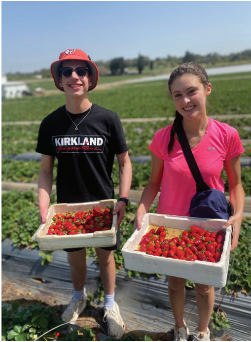
Among other volunteer work in Israel last spring, seniors at Golda Och Academy picked fruit near the border with Gaza.