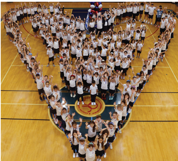
Students at Donna Klein Jewish Academy in Boca Raton displayed their love and support for the Jewish state in the school gym.

For many in the day school world, the attack on October 7 was personal. These schools have Israeli teachers