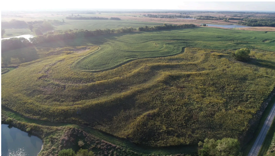
The sun shines on Doug Doughty’s fields, highlighting the terraced landscape. These slopes slow water down as it heads from the field into the underground tile system, reducing soil erosion and nutrient runoff.