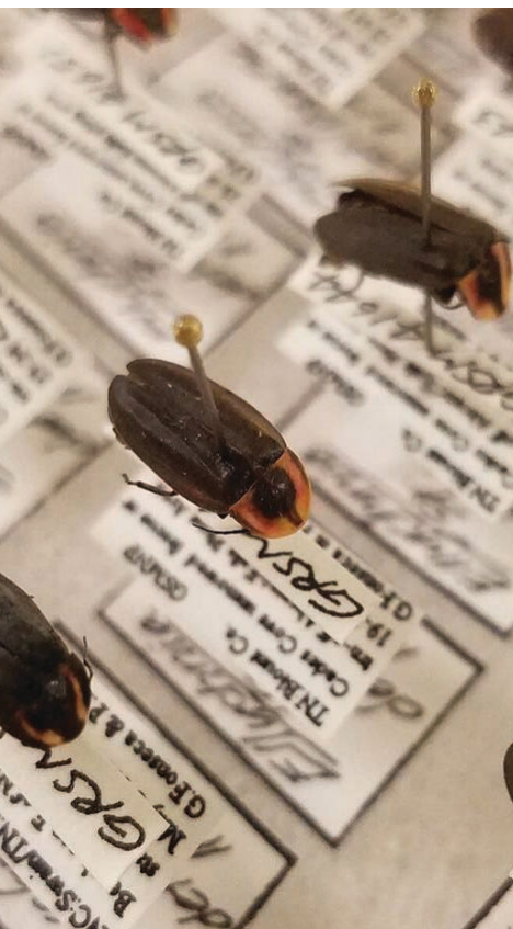
Fireflies may be the Smokies' most famous insect residents, but since the advent of the All Taxa Biodiversity Inventory, over 6,000 other insects have been cataloged in the park.

"Humans can help fireflies thrive by considering the habitats required for them to complete their lifecycle," says Nichols. "Minimal or no lighting at night will benefit not only fireflies, but other nocturnal animals as well. Also limit pesticides you use and always follow label directions to avoid harmful effects on non-target insects, such as fireflies and pollinators."