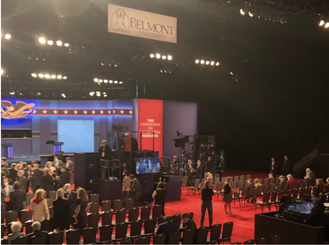
Curb Center at Belmont University prior to start of second presidential debate on Oct. 22, 2020

A funny thing happened on the way to the forum—specifically recent online League of Women Voters forums in Knox County. The funny thing was that the Republican candidates didn’t show up while the Democratic candidates did —with one exception within each party.