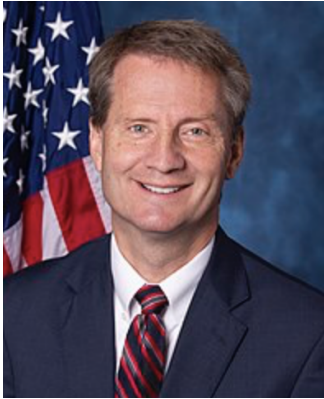
U.S. Rep. Tim Burchett, R-Knoxville