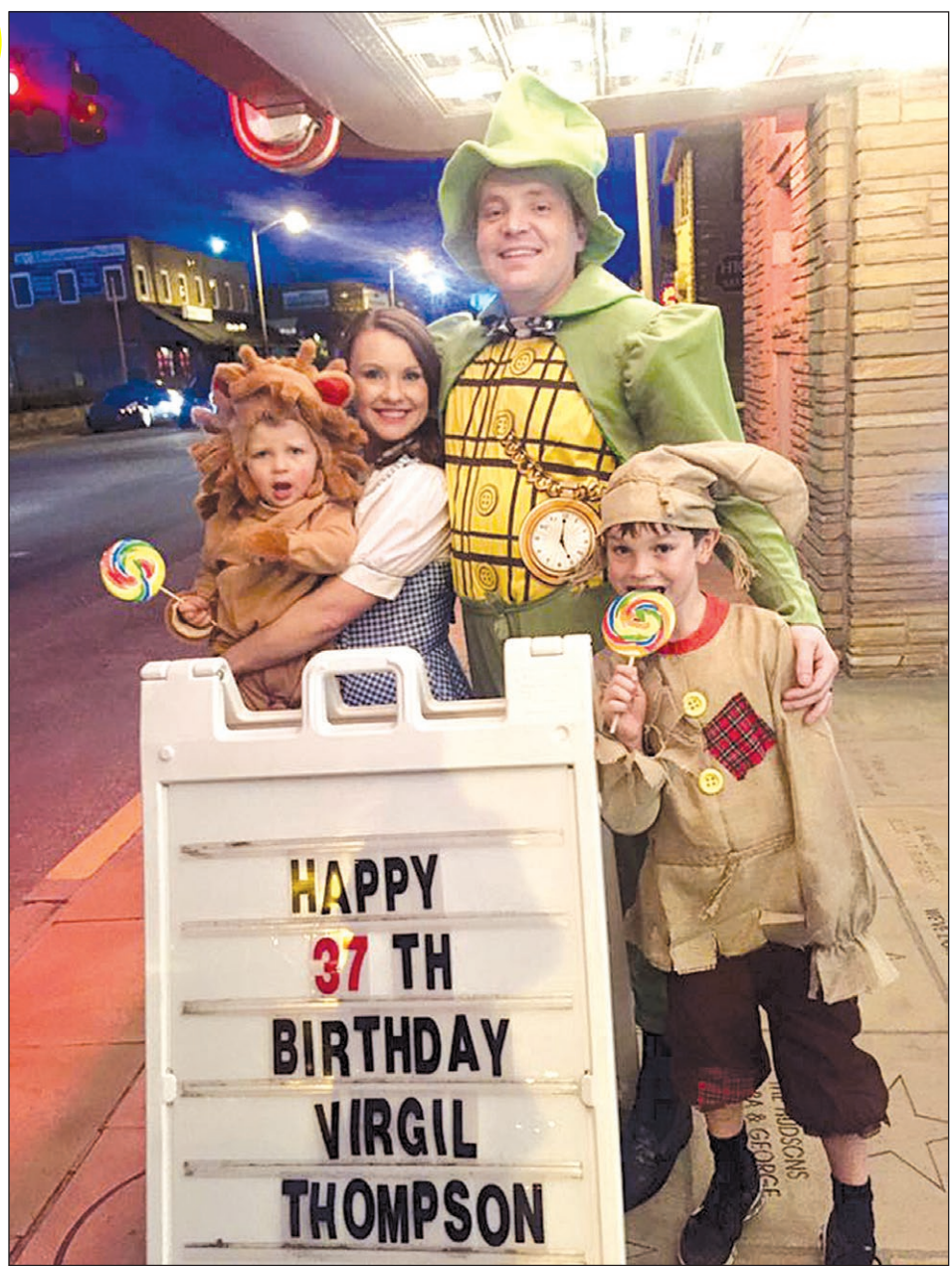
The average life expectancy for someone with cystic fibrosis is 36. Every day afterward is a gift.

■ Heather Mullinix may be reached at hmullinix@crossville-chronicle.com .