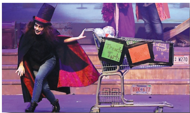
CCP show a delight • The Scene

Wednesday February 5, 2020 Volume 134 • Issue 16