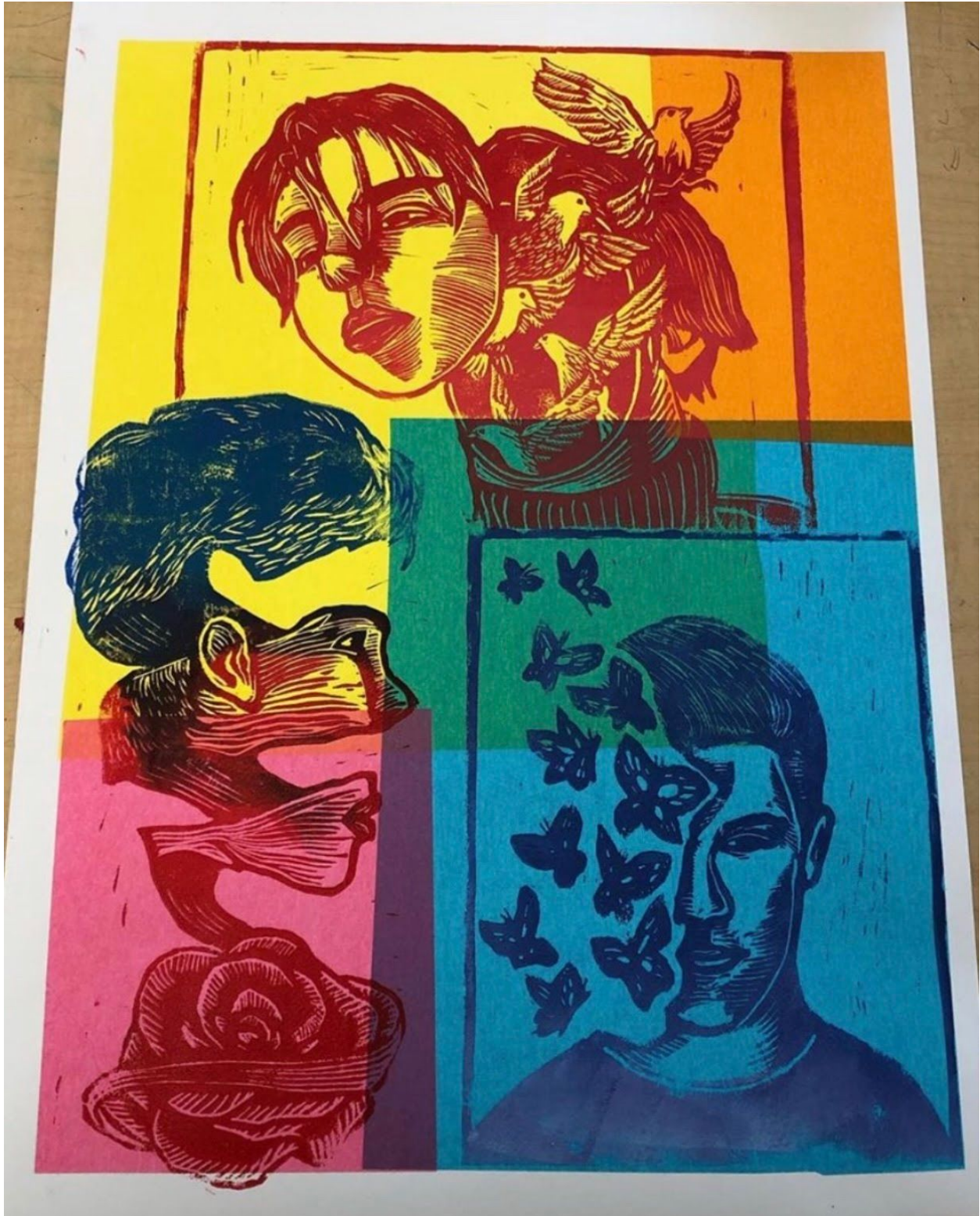
This piece was a mixture of three different pieces put together on different colored tissue paper. The two bottom pieces are Shawn Mendes (Bottom left- inspired by the song "Roses" by Shawn, Bottom right- inspired by "Youth" by Shawn Mendes, Top inspired by "Face to Face" by Ruel)