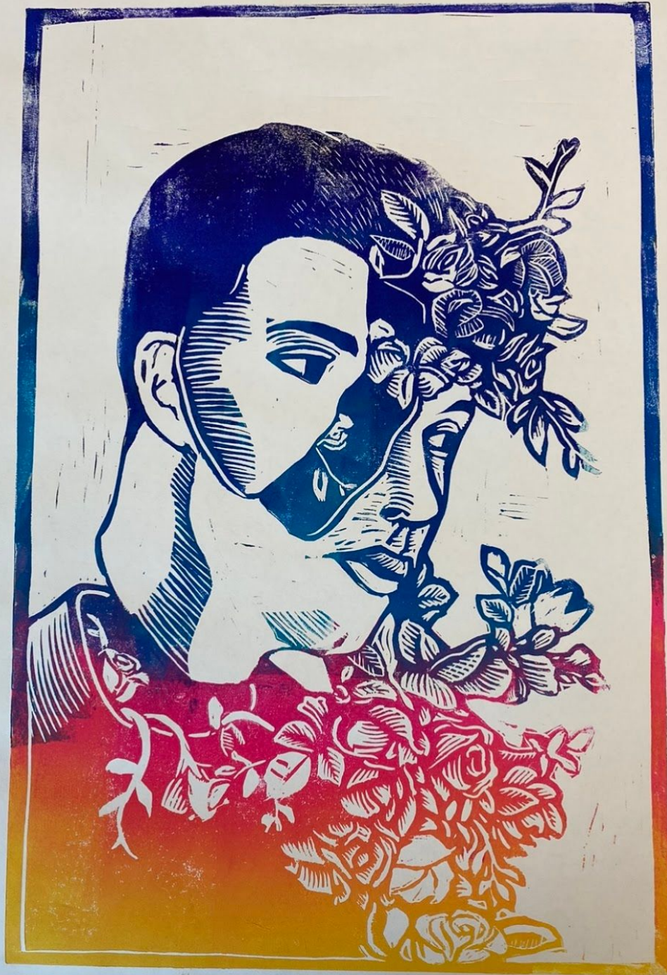
"Blossoming" was inspired by Shawn Mendes's third studio album: " Shawn Mendes " his album