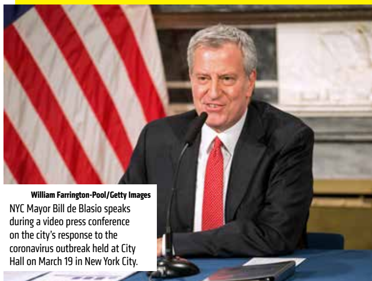
NYC Mayor Bill de Blasio speaks during a video press conference on the city's response to the coronavirus outbreak held at City Hall on March 19 in New York City.