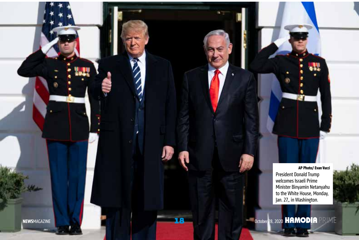
President Donald Trump welcomes Israeli Prime Minister Binyamin Netanyahu to the White House, Monday, Jan. 27,, in Washington.

These points, plus window dressing such as