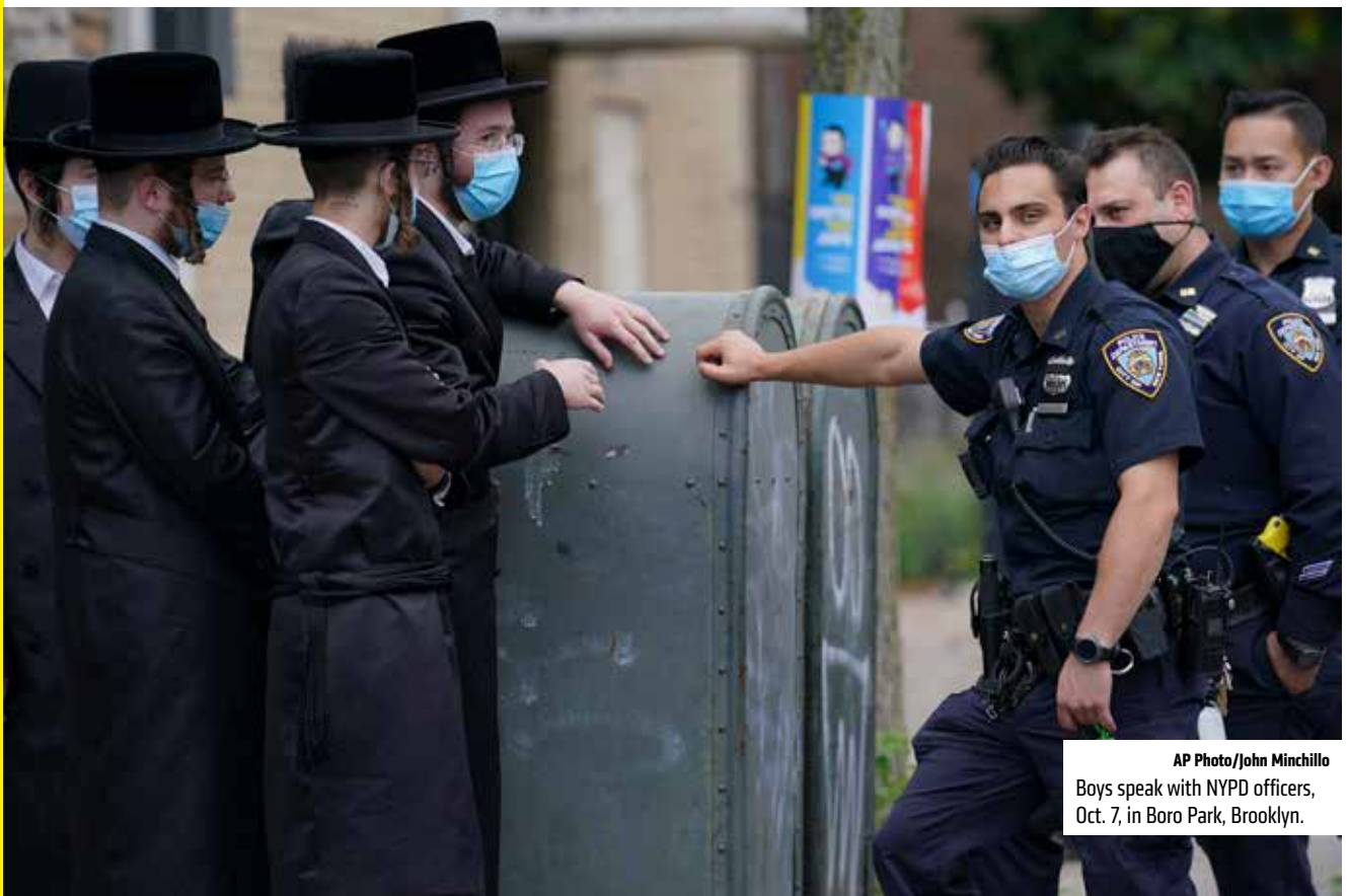
Boys speak with NYPD officers, Oct. 7, in Boro Park, Brooklyn.

IN DEEP BLUE STATES, THE PRIMARY IS THE ELECTION ... THOSE THAT ARE NOT FRIENDS ARE VERY HAPPY TO SEE US REGISTERING AS REPUBLICANS BECAUSE IT RENDERS OUR VOICE IRRELEVANT.