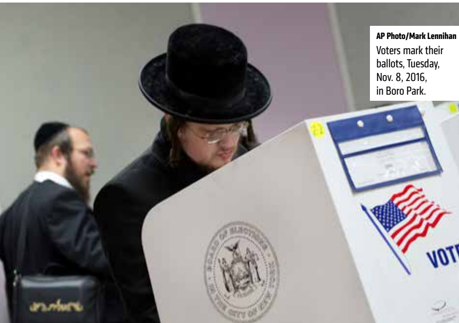
Voters mark their ballots, Tuesday, Nov. 8, 2016, in Boro Park.

he felt it was “important for people to vote their conscience” and said that he was not advocating against voting for Republicans in national elections.