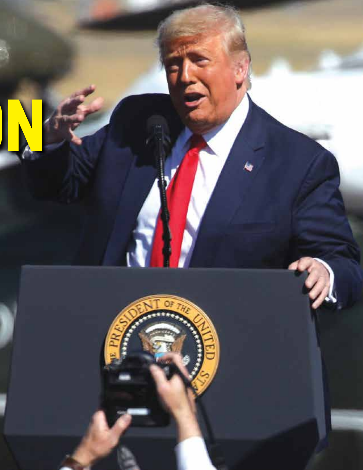
President Donald Trump speaks at a Make America Great Again campaign rally on October 19 in Prescott, Arizona.